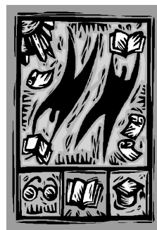
"Hard work is the key to success"

Too many students believe that only smart children will do well in school. Yet any parent can teach students that anyone can succeed...if they are willing to put in the work. When successful students don't understand something right away, they keep at it. The result is that 'hard working' students, regardless of their intelligence, often outscore other children on tests in